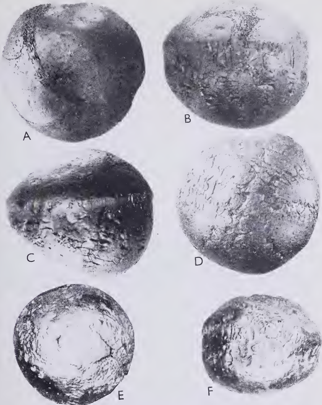
Fig. 2: Large australites from Western Australia. Natural size. For key to specimen numbers, see Table 1. In elevational views, direction of flight is towards bottom of page. A: No. 2, posterior surface of flight. B: No. 2, elevation. C: No. 2, elevation showing obliquity of part of anterior surface to line of flight. D: No. 2, as seen in a direction normal to the oblique part of the anterior surface, rim at top. E: No. 6, posterior surface showing abundance of minor sculpts where thin flakes have been lost. F: No. 6, elevation.